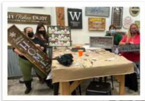
Thank you all the participants in our Board & Brush fundraisers on October 21st & December 7th.