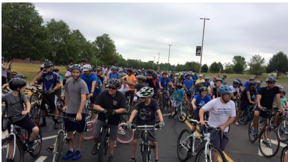
Riders Gathering for the 9th Annual Tour de South Brunswick